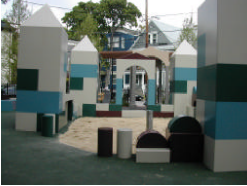
Maple Avenue Park – Cambridge, MA Design: PlaySite Architecture – MA Industrial Design & Fabrication - MA