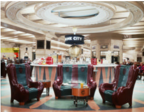
Grand Central Terminal Chairs Design: The Rockwell Group – NY