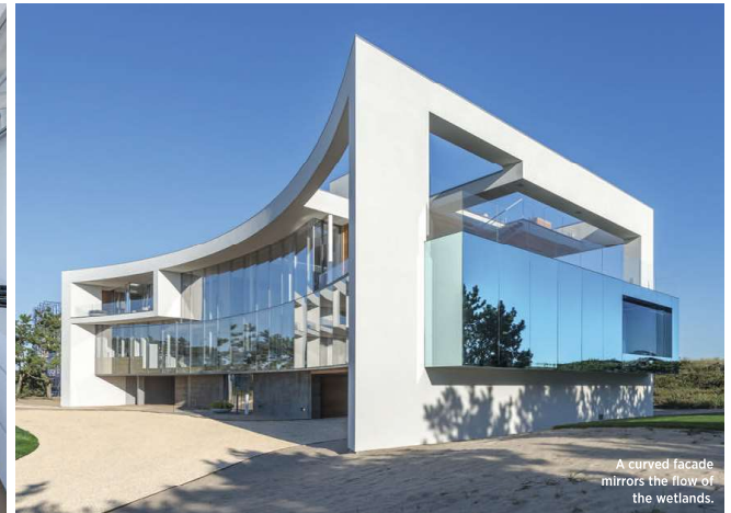
A curved facade mirrors the flow of the wetlands.