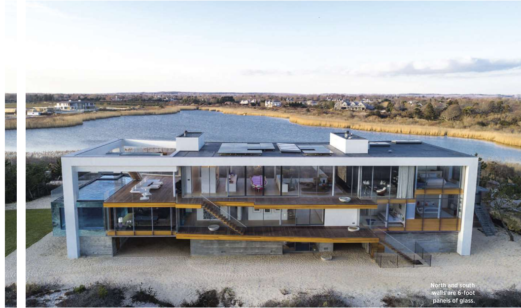
North and south walls are 6-foot panels of glass.